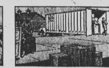
to receiving platform...

Flexi-Vans loaded on New York Central's fast freight trains maintain 2nd morning deliveries between the Albany-Troy-Schenectady area and Chicago, Joliet and Kankakee.