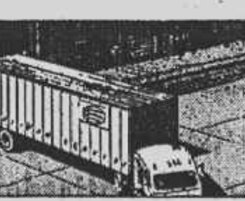
From shipping platform...

Flexi-Van picks up your shipment on schedule. You take advantage of the flexibility of the local truck at your shipping door plus the reliability of cross-country rail transportation.