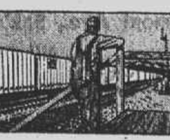
your freight highbills...

At the railroad terminal, one man slides the loaded Flexi-Van off the truck wheels onto special flat car in about 4 minutes. This adds up to speedier, more dependable service.